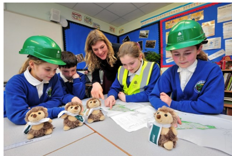
Visit From Sanctuary Housing

Thursday 7th March. On this day, the children can come to school dressed as their favourite book character. If possible, it would also be good if the children could bring the book their character is from with them to school. These will then be discussed and shared within each House.